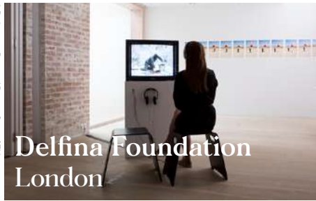
A Prologue to Past and Present State of Things Exhibition